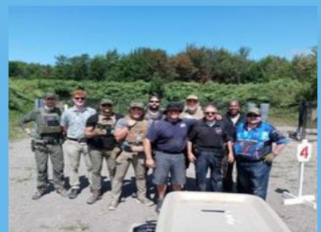
Squad 1 of the August Allstar Tactical rifle shoot