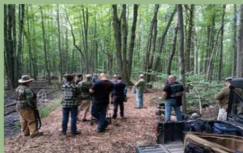
August Jungle Run at the ORGC Challenging course... Lots of fun!! Go to PractiScore and sign up for the next event!

Questions? Email us for help! communications@theorgc.com