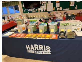
Thank you Harris Seed and so many others for their generous raffle donations!