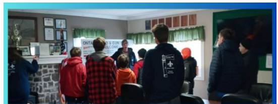
We welcomed Boy Scout Troop 48, Greece NY to the ORGC March 25th!