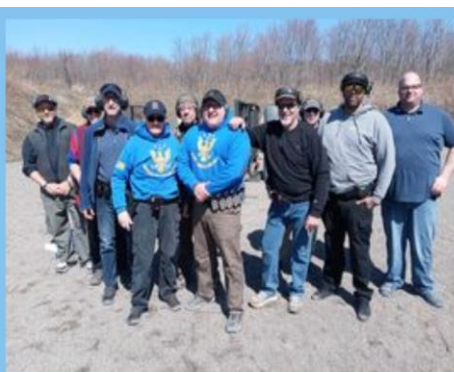
Squad 1 First USPSA Shoot of the Year April 8, 2023